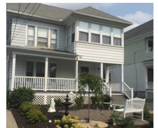
Visit us at 107 Michaels Ave

Generous benefactors who value the fruits of our ministry wanted us to be self-sustaining and continue our holy work in a place of our own. They made a generous down-payment on a nearby two-family house. Another benefactor, moved by this gift, promised a triple-match to pay off our mortgage in just 3 years! Yet another gracious benefactor paid for the renovations. Then, our city required further code upgrades for an occupancy permit. This July we were blessed to move in, thankful for this gift! (Please pray for us to now recover our unexpected expenses!)