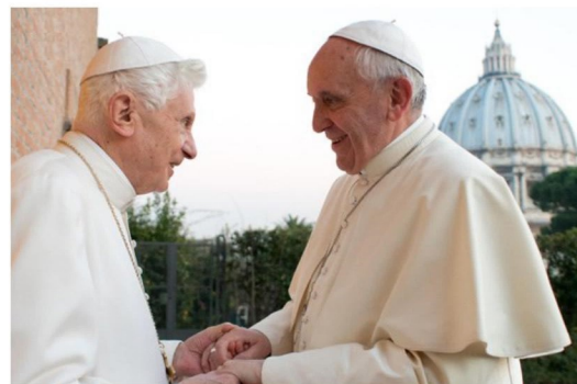
Pope Emeritus Benedict XVI and Pope Francis

In 2013, Pope Francis then proclaimed a Plenary Indulgence, for the same experiences through 2020. This is the first time in the history of the Catholic Church an indulgence is granted for a “virtual experience” as equal in grace to an actual experience. Further, this year Pope Francis issued indulgences to each Lourdes Volunteer on our feast days and every act of charity, mercy, penance or evangelization in our charism. We are blessed!