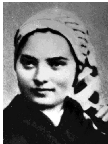
St. Bernadette Soubirous

At Lourdes Volunteers, "love without measure" is our rule—and our holy ruler—our spiritual measure in all practical tasks that we do. "Love without measure" is not just our motto, it is the truly immeasurable tool we must use to live the Gospel Message of Lourdes in our charism, in our loving care for the sick, for each other and all we encounter.