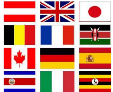
13 Countries in 10 Years!

A visually guided visit brings a Lourdes experience to life with Grotto Rocks, Lourdes Water, a Eucharistic Blessing and Rosary Candlelight Procession. More than 100,000 “pilgrims” have now experienced Lourdes through our Virtual Pilgrimages at parishes, schools and prisons in 37 states and 13 countries on 4 continents, 11 Native American Nations and across northern China in 2015.