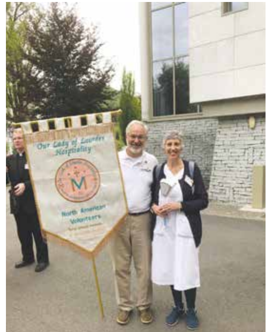
Getting ready for the candlelight Rosary procession