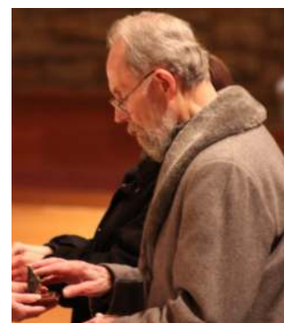
Touching the Grotto Rock

Eucharistic Adoration and blessing joining “pilgrims” together to pray a decade of the Rosary in a Candlelight Procession; the spirit and essence of pilgrimage is captured in less than 90 minutes. Virtual Pilgrimages in Catholic schools, hospices, prisons, colleges, universities and to organizations or groups is offered at no charge, supported by free-will offerings at parishes throughout little towns and big cities across North America and our military communities throughout the world.