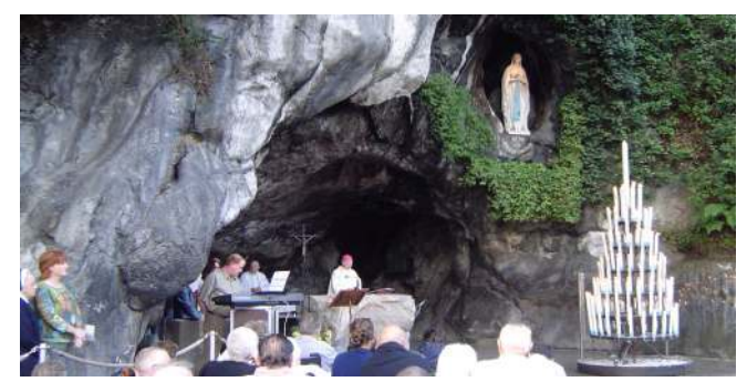
June 2005 Holy Mass in the Grotto

P. O. Box 3820, Syracuse, NY 13220 USA Our Lady of Lourdes Hospitality North American Volunteers, LTD.