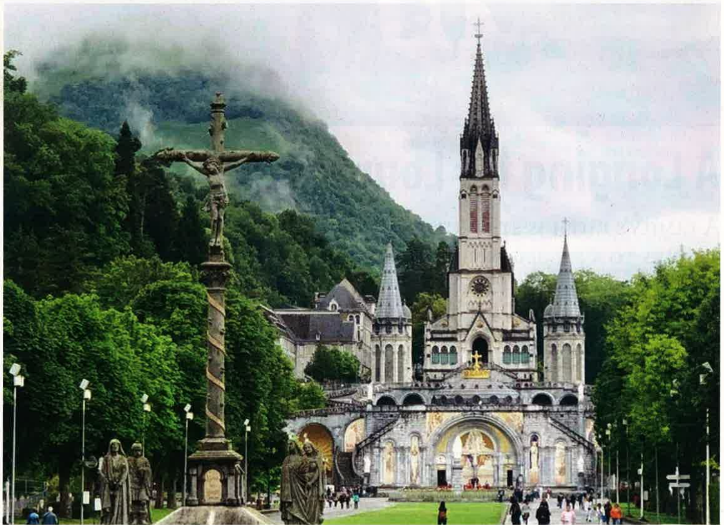
The Breton Calvary Cross overlooking the basilica's from the St. Michael gate entrance to the Sanctuary of Our Lady of Lourdes.