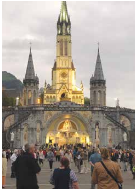
The Immaculate Conception Basilica