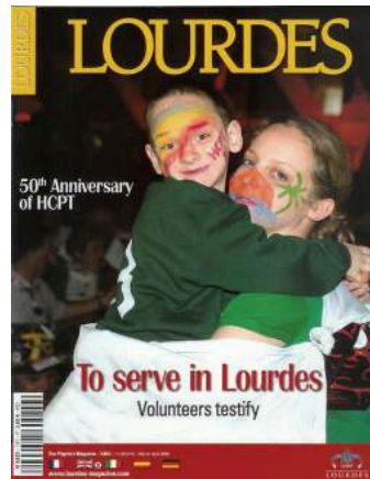
March-April Lourdes Magazine

The March-April 2006 issue of Lourdes Magazine is dedicated to all members of Hospitalities from around the world. Two pages feature an article about North American Lourdes Volunteers. The full two-page story includes two photos of groups who offered service in the fall of 2005 and some of their experiences. To request a copy of this issue or to subscribe to Lourdes magazine, call (315) 476-0026.